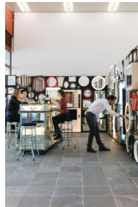
3 View of "Duet with Artist," 21er Haus, Vienna, 2017.