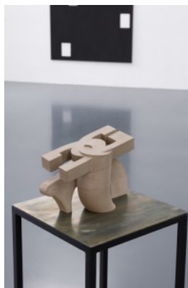
6 Andy Boot, Smart Sculpture (two) , 2017.