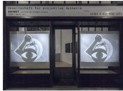
1 View of Ferdinand Kriwet's "KRIWET," curated by Gregor Jansen, Georg Kargl Fine Arts, Vienna, 2017.

The 21er Haus exhibition was billed in the Viennese press as a weekend activity for children, which is fair enough considering the ping-pong, drawing, and cutting-and-pasting done in the space. More sophisticated exhibitions of participatory art explore the meaning of participation rather than simply offer it up, but as museums struggle for funding and recognition, these two institutions