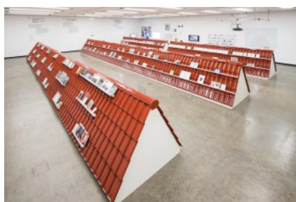
9 View of "Publishing as an Artistic Toolbox: 1989–2017," Kunsthalle Wien, 2017.