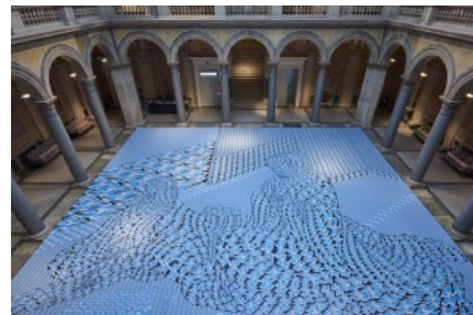
4 Thomas Bayrle, iPhone meets Japan , 2017.