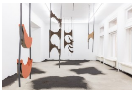
7 View of Angelika Loderer's "Quiet Fonts," Sophie Tappeiner, Vienna, 2017.