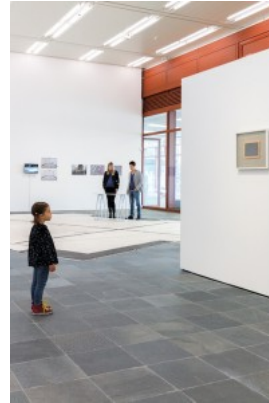
2 View of "Duet with Artist," 21er Haus, Vienna, 2017.