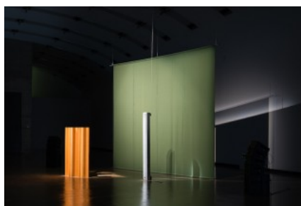
8 View of Florian Hecker's "Hallucination, Perspective, Synthesis," Kunsthalle Wien, 2017.